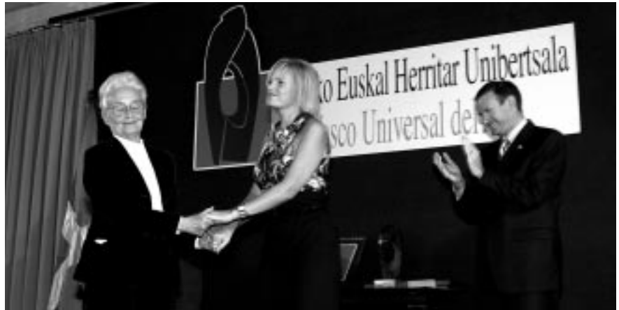
Ainhoa Arteta and Martín Ugalde's wife, during the award ceremony.

Ibarretxe highlighted the honesty, sincerity and serenity of Martín Ugalde (who was not able to attend the award