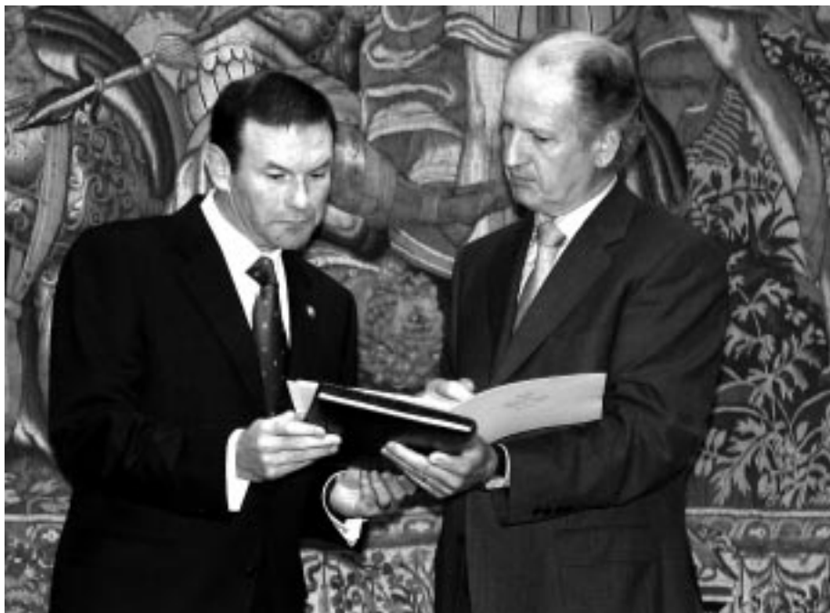
The Lehendakari Juan José Ibarretxe delivers the text of the new Statute for the Basque Country to the President of the Basque Parliament, Juan Mari Atutxa.