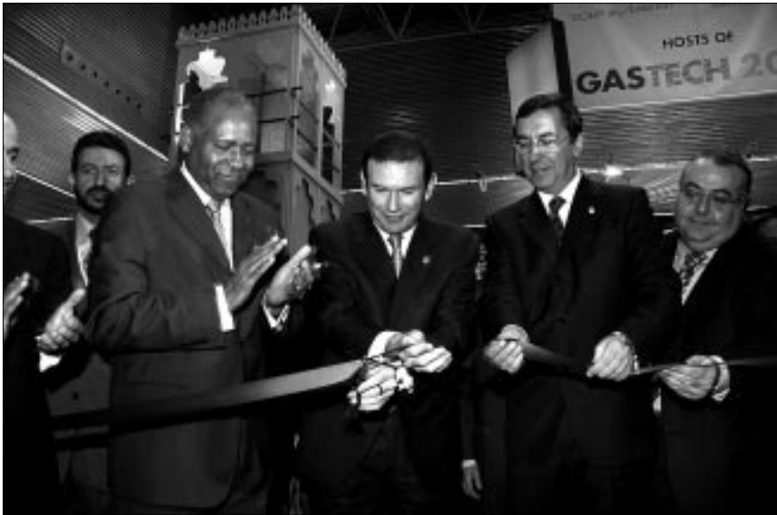
Nearly 2,000 delegates from 60 countries met in the Basque Country.